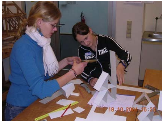
2133 bau G4