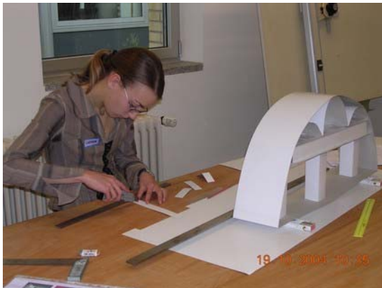
2150 bau G3