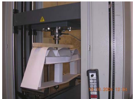
2168 Prüfung G3