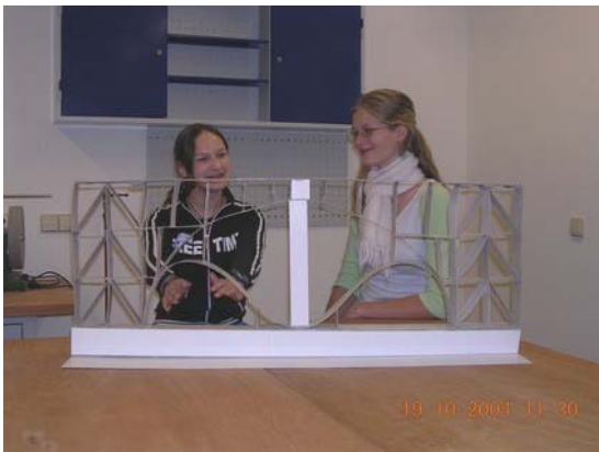
2165 bau G4