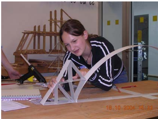
2142 bau G4