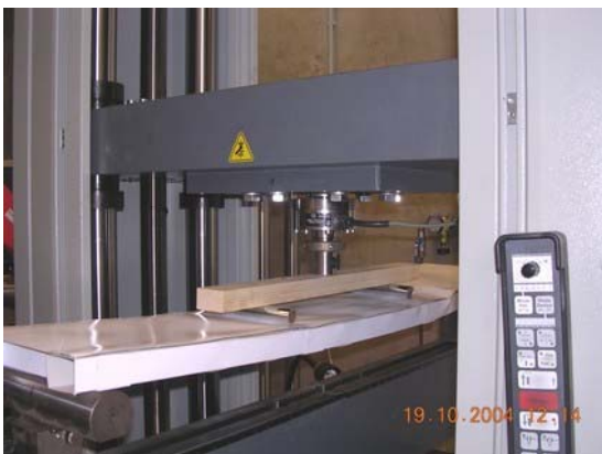
2170 Prüfung G1